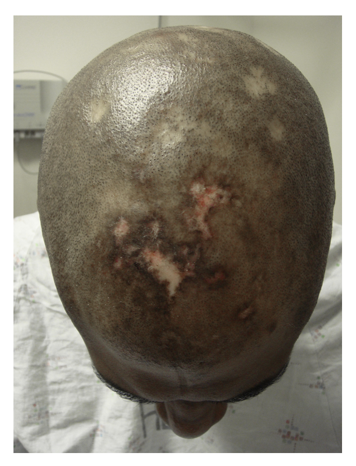
Fig. 3. DLE of the scalp. Longstanding discoid lesions show atrophy, with hyperpigmentation peripherally and depigmentation centrally.

between the various auto-immune diseases. Rather, CLE diagnosis should be based on the findings of patient history, clinical examination, laboratory studies, serology as well as histology and DIF examination of skin biopsies if the histology is not diagnostic.