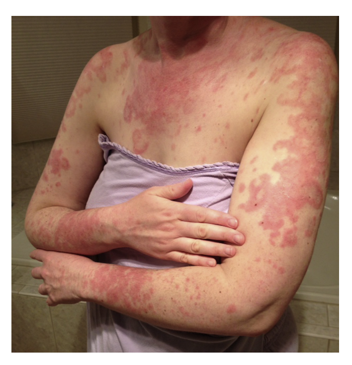
Fig. 1. SCLE, annular polycyclic. Scaly annular erythematous plaques coalesce into polycyclic arrays.