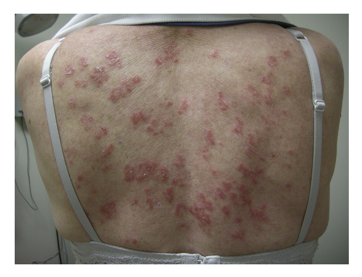
Fig. 2. SCLE, papulosquamous. Psoriaform lesions which coalesce to form retiform arrays.