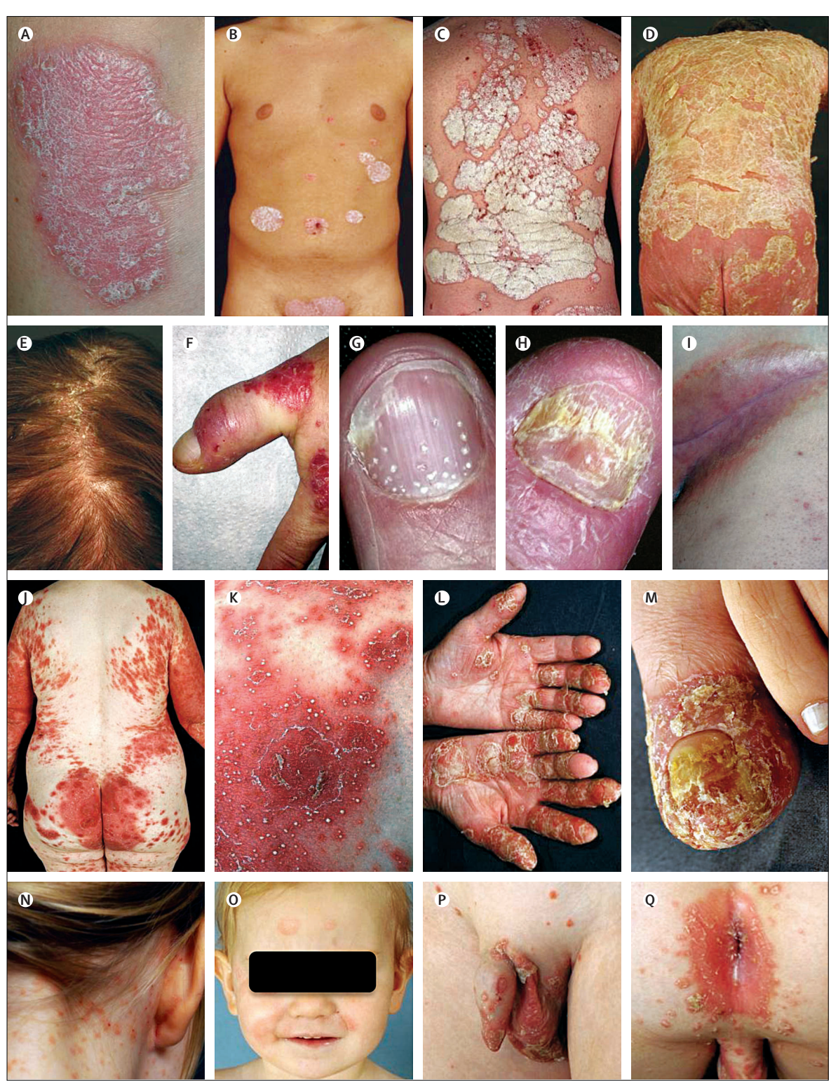
Figure 1: Clinical manifestations of psoriasis

Typical erythematous plaques with silvery scales (A) can be scattered (B, psoriasis nummularis), cover larger areas of the skin (C, psoriasis geographica) or affect the entire body surface (D, erythrodermic psoriasis). Scalp involvement might be accompanied by non-scarring alopecia (E). Psoriatic arthritis affects up to 30% of all patients (F, thumb interphalangeal joint). Nail changes are frequent and range from pitting and yellow or brown discolouration (G) to complete dystrophy (H). Psoriasis inversa occurs in intertriginous areas and is usually devoid of scales (I). Pustular psoriasis might occur in a generalised form (J, K) or localised (L, palmoplantar type and M, acrodermatitis continua suppurativa type). In children, the onset as guttate psoriasis might follow streptoccoccal infection of the upper respiratory tract (N) and affect any site of the body (O,P,Q).