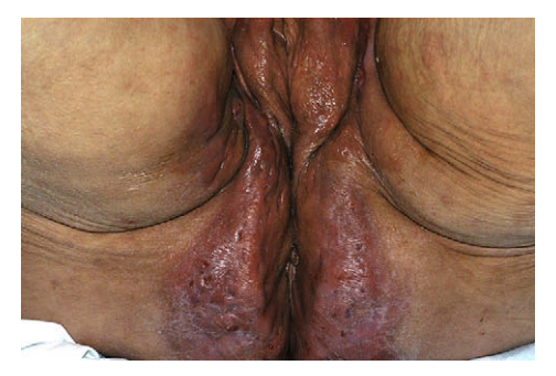
Fig 7. Patient with Hurley stage III hidradenitis suppurativa before wide excision.

A study comparing grafting to second intention healing following axillary excision of HS was performed in 10 patients with 20 treated axillas.<sup>223</sup> The median time to complete healing was 7 weeks for the grafted sites and 12 weeks for the second intention sites.<sup>223</sup> Seven of ten patients preferred the second intention healing method because of ease of use, limb mobility, lack of painful donor site, and comfort.<sup>223</sup> Two patients preferred the more rapid healing of the graft site and one patient disliked both methods.<sup>223</sup>