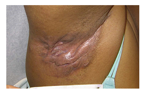
Fig 4. Hurley stage III—multiple interconnected tracts and abscesses throughout an entire area.