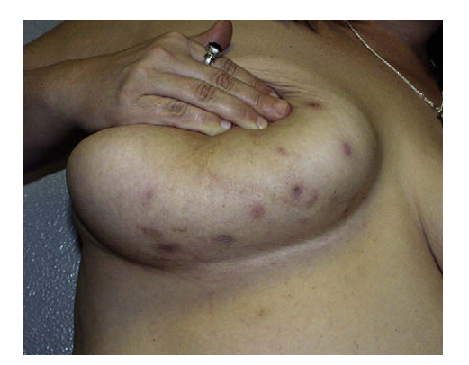
Fig 1. Inflammatory papules and nodules in the inframammary area typical of hidradenitis suppurativa.

debilitating outcomes than axillary HS.<sup>15,24</sup> Lesions often initially occur in the axillae and anogenital regions, but once the disease advances, new lesions develop in areas of friction, including the submammary region (Fig 1), the nape of the neck, the waistband area, and the inner thighs.<sup>2</sup>