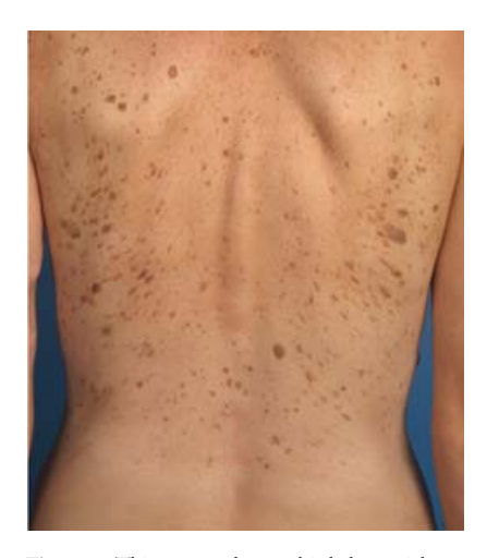
Figure 3: This woman has multiple brownish seborrheic keratoses which show a striking arrangement reminiscent of a "Christmas tree pattern."

Lesions are sharply demarcated, round or oval-shaped, usually elevated and stuck on the skin with a verrucous, uneven, dull, or punched-out surface