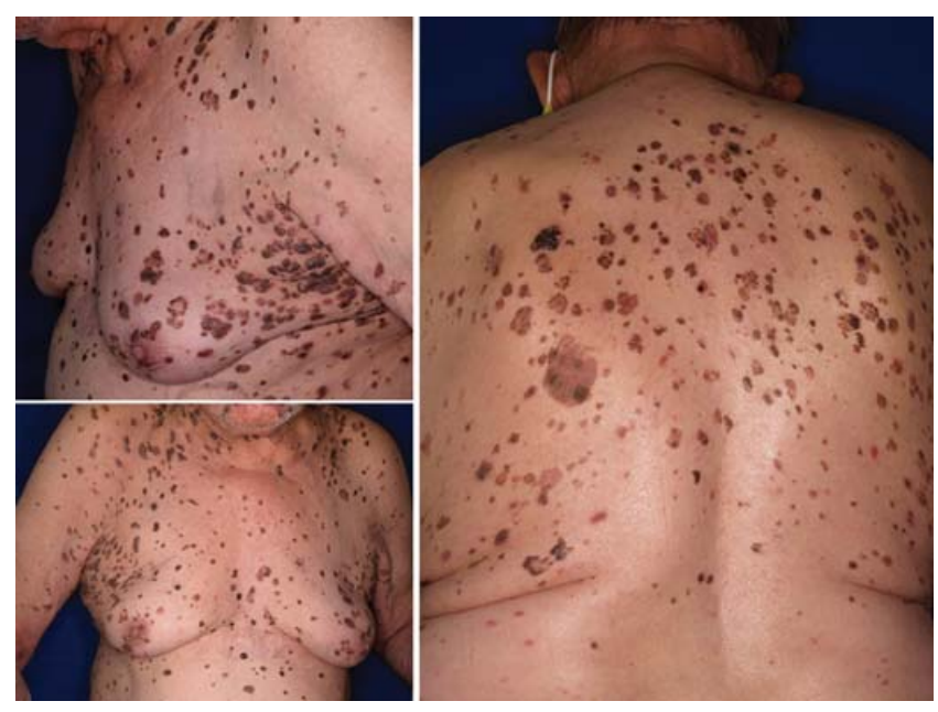
Figure 2: Seborrheic keratoses may appear in large numbers. This male patient displays a large number of darkly pigmented seborrheic keratoses showing a striking morphological variety with some lesions revealing an unusual rosette-like pattern. The patient reported that his father revealed also multiple seborrheic keratoses. An increased cumulative sun-exposure or multiple sunburns were denied.

Lesions are sharply demarcated, round or oval-shaped, usually elevated and stuck on the skin with a verrucous, uneven, dull, or punched-out surface (Figure 1). Flat seborrheic keratoses often have a smooth, velvety surface and are barely elevated above the surface of the skin. Whether these flat forms are merely initial seborrheic keratoses, which grow thicker over time, or whether they are a sub-type is still unclear. Some seborrheic keratoses have a surface which appears rather oily and shiny, hence the misnomer "seborrheic" (i.e., greasy) keratosis. Seborrheic keratoses typically appear as if stuck on the skin. Lesions range in size from a few millimeters to several centimeters, with a typical diameter of 0.5–1 cm. Lesions vary in color and may be skincolor/yellowish, gray-brown, or black. Pediculated forms have also been observed in intertriginous areas. Seborrheic keratoses are often penetrated by invaginations of keratotic plugs and horn cysts (filled with concentrically attached keratin). On dermatoscopy these appear as "pseudofollicular openings" and "horn pseudocysts" with light, sharply bordered, round plugs. Inflammation around the margin of the lesion can occasionally occur (Meyerson phenomenon).