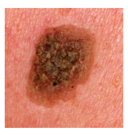
Figure 1: Clinical picture of a typical seborrheic keratosis.