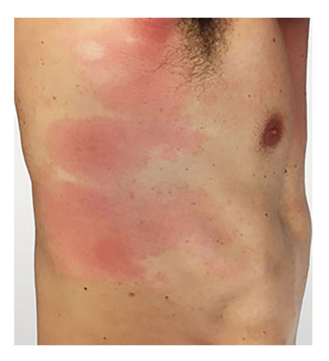
FIGURE 1 Mycosis fungoides (patch stage): Erythematous slighty infiltrated lesions (patches) on the trunk

Sézary syndrome (SES) is a rare but aggressive CTCL entity characterized by cutaneous involvement and a leukemic component. Molecular studies showed that the tumor cells in SES are derived from central memory T cells whereas the neoplastic T cells in MF are effector memory T cells.<sup>6</sup> The clinical findings include erythroderma, generalized lymphadenopathy, and an intense pruritus. Atypical