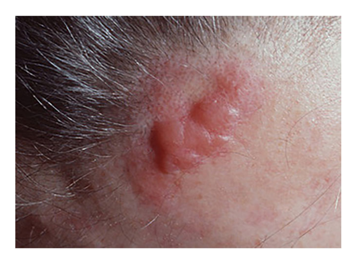
FIGURE 4 Primary cutaneous follicle center cell lymphoma: Erythematous nodules with a surrounding plaque on the forehead

Diffuse large B-cell lymphoma, leg type (DLBCL-LT) is a rare but aggressive CBCL most commonly affecting elderly women and manifesting with rapidly enlarging nodule(s) on one or both legs. <sup>1,19</sup> More rarely, this lymphoma occurs at other anatomic regions. Histology shows dense infiltrates of mainly centroblastic and/or immunoblastic