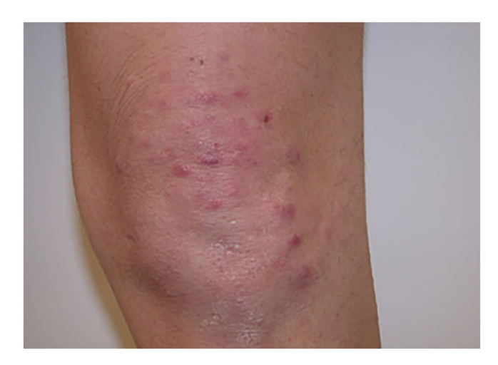
FIGURE 3 Primary cutaneous CD30-positive lymphoproliferative disorder; lymphomatoid papulosis: Multiple grouped erythematous to violaceous papules

Clinically, LYP presents with grouped or disseminated papules and small nodules, which undergo spontaneous regression within few weeks (Figure 3). Five different histological subtypes (referred to as type A-E) and a subtype with chromosomal rearrangements involving the DUSP-IRF4 locus on 6p25.3 are listed in the current classification.<sup>8</sup> Due to overlapping histological features with other lymphomas, clinico-pathological correlation is crucial for the diagnosis. LYP carries