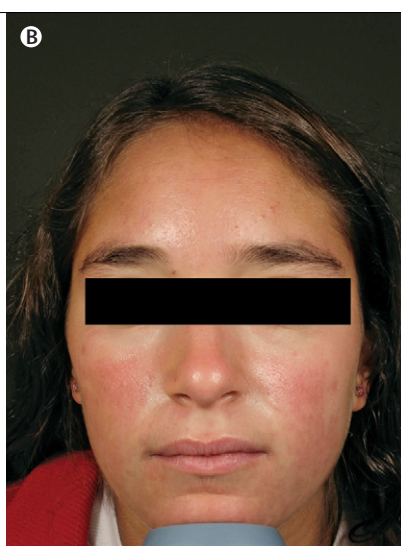
Figure 3: Before (A) and after (B) view of a woman with severe acne treated with a course of isotretinoin Reproduced with permission from Amy Derick; full patient consent was received.

studies were generally of poor quality and inconclusive. Another systematic review found some benefit for acupuncture with moxibustion, but the quality of included studies was limited.109 A systematic review of four RCTs of tea-tree oil in 2000 did not find conclusive evidence of benefit,110 although a recent well-reported study of 60 people in Iran with mild-to-moderate acne showed a modest reduction in lesion count and few local adverse effects when compared with placebo, suggesting that larger trials might be worthwhile.111 CAM cannot be recommended for acne treatment because it is not supported by good evidence—CAMs might work, but the key studies have not been done, or when done, they have been inconclusive or reported poorly. CAM therapy for acne is a research gap that needs to be addressed given the high degree public interest and spending on CAM approaches.