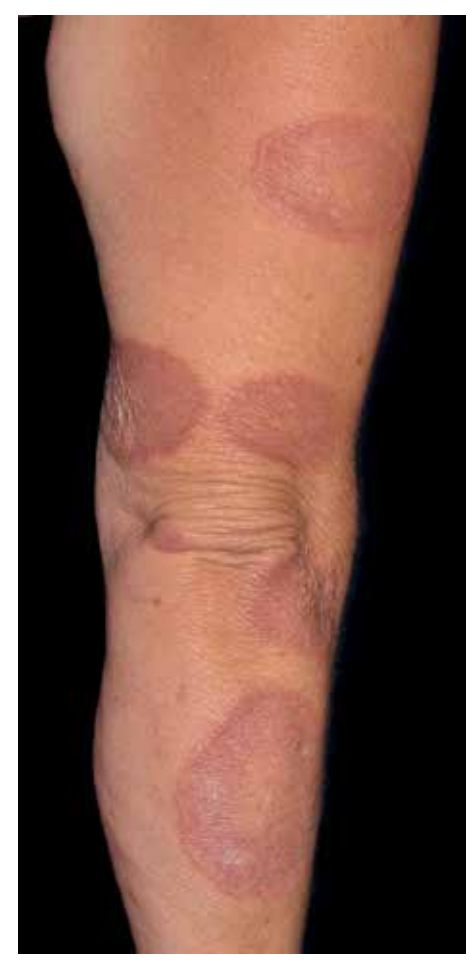
FIGURE 5: G r a n u l o m a annulare manifests by erythematous and firm dermal papules that expand gradually, with central hyperpigmentation