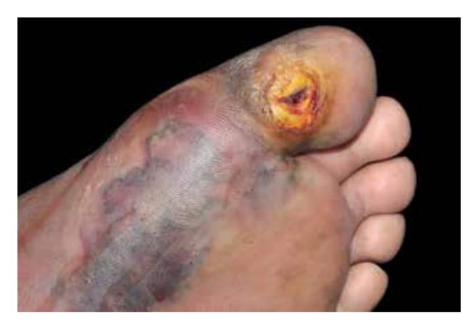
FIGURE 9: Diabetic foot may present a chronic ulcer on callus caused by changes in sensitivity associated with diabetic neuropathy and occasional ischemia