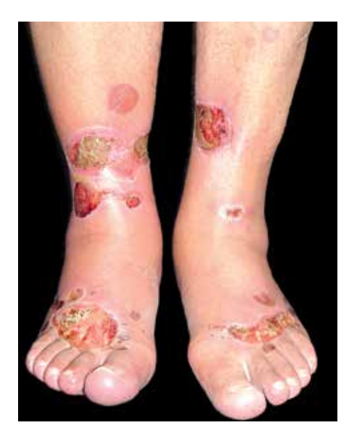
FIGURE 2: Bullosis diabeticorum blisters are asymptomatic and exhibit mild inflammation

Pathophysiology of the BD bullae is still unknown. The blisters are large, tense and characterized by sudden and spontaneous onset in acral regions. Phe diameter of the blisters varies between 0.5 and 5cm, they are often bilateral, with an inflammatory base, and contain a clear, sterile, nonserous content. Other affected places are the back and side of the hands and the arms. These blisters are usually painless and non-pruritic and disappear spontaneously without scarring in 2 to 5 weeks.