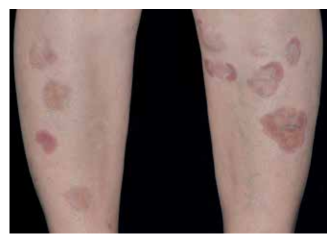
FIGURE 7: Typical lesions of necrobiosis lipoidica begin in the pretibial regions with non-squamous papules that gradually grow and group into large plaques