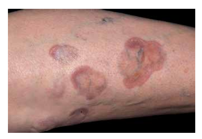
FIGURE 8: Detail of lesions of necrobiosis lipoidica, showing central atrophy