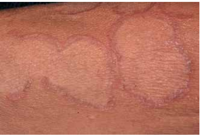
FIGURE 6: Detail of the granuloma annulare, showing infiltration at the edges of the lesion