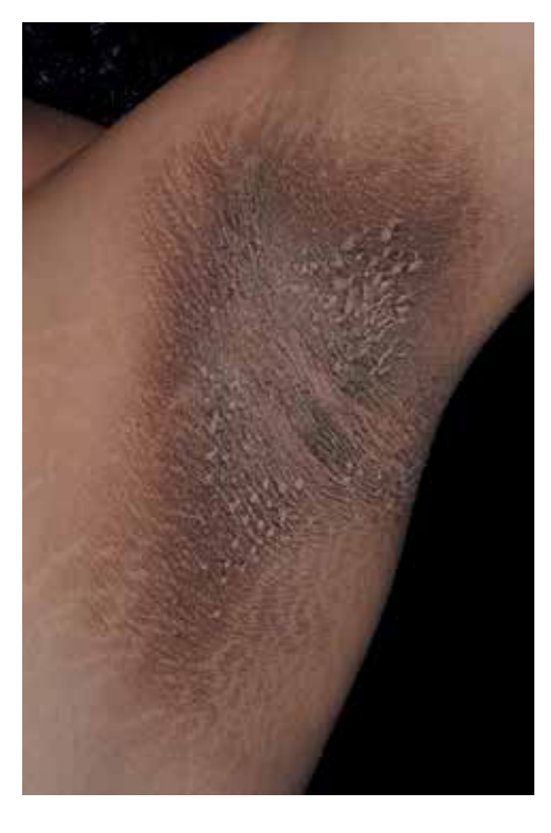
FIGURE 1: Armpits are a classic location of acanthosis nigricans. Note the thickening and hyperchromia of the skin

Acanthosis nigricans (AN) is characterized by skin thickening with hyperchromic and a velvety aspect that occurs mainly in the folds, especially in the armpits (Figure 1). Currently, it is postulated that is caused by hyperinsulinemia, which promotes the synthesis of type 1 insulin growth factor (IGF1) that leads to epidermal