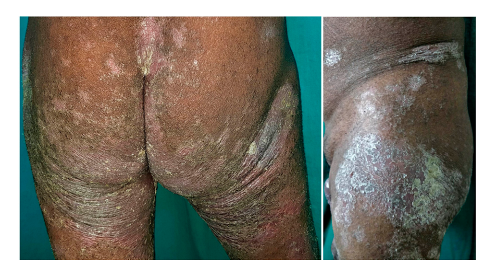
FIGURE 1. Multiple erythematous hyperkeratotic crusted plaques over the gluteal region and lateral aspect of thighs. This figure appears in color at www.ajtmh.org.

This is an open-access article distributed under the terms of the Creative Commons Attribution (CC-BY) License, which permits unrestricted use, distribution, and reproduction in any medium, provided the original author and source are credited.