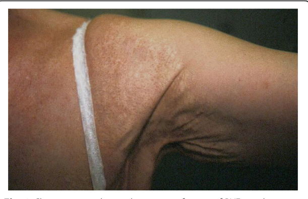
Fig. 2 Characteristic advanced cutaneous feature of PXE: involvement of axillary flexural folds