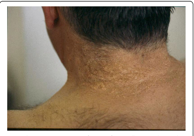
Fig. 1 Characteristic cutaneous feature of PXE: yellow papules on the nape of the neck give the skin a peau d'orange aspect

Electron microscopy of the skin reveals bulky, sometimes needle-like mineral deposits that disrupt and break elastic fibers (particularly in the mid-dermis) [13, 21, 22] (Fig. 3). Collagen irregular fibrils have been reported in the skin, myocardium and pericardium [23]. It has been reported that areas of clinically normal skin in PXE patient also contain damaged elastic fibers; it remains to be seen whether this change is an early marker for PXE [21].